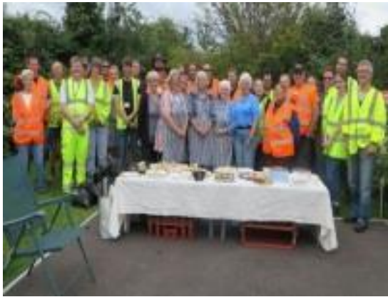
Bucks and Oxfordshire Response Group, County and District Councillors, Council officers and Residents at the event.

The Willows Flood Deployment Force is made up of County, District and Town Councillors, Council officers and members of the 20-strong Bucks and Oxon Response Group who used their four-wheel drive vehicles to move the defences from the County Council's Griffin Lane Depot to the Willows estate.