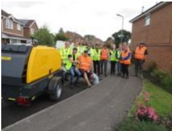
Bucks and Oxfordshire Response Group, County and District Councillors, Council officers and Residents with the pump.